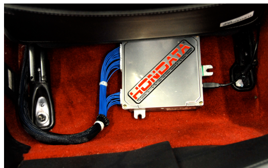
K-Pro mounted behind passenger seat